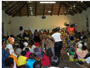
Guardians of Land, Life and Love